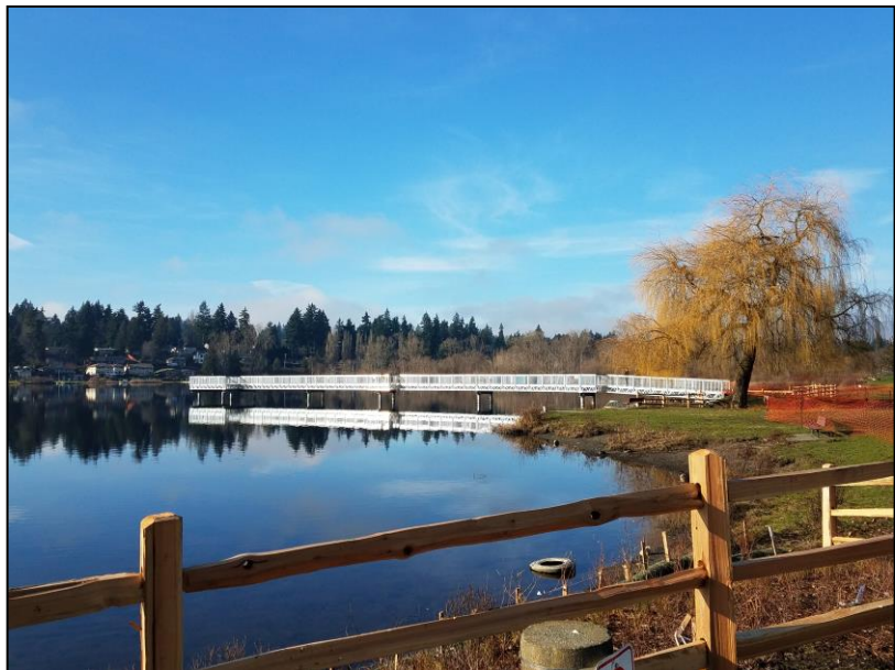
New Fishing Pier

Some fencing will remain on site to protect new plantings that remain vulnerable. Please follow all posted signs as the crews wrap up remaining tasks.