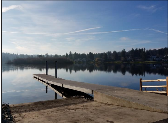
New Boat Launch and Boat Dock

Many of the amenities were originally installed in the 1970s, and the park needed to better account for modern standards around accessibility and habitat protection.